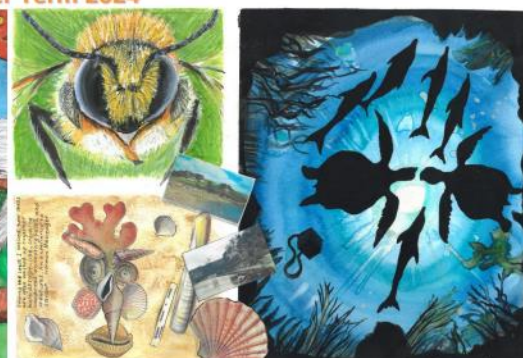
Class 3 – Sea Monsters and Plant Hunters Wildlife, art and beaches