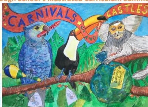
Class 2 – Carnivals and Castles Life in Brazil and Castles