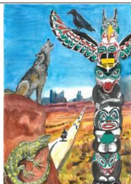
Class 5 – Stars and Stripes A road trip through the USA