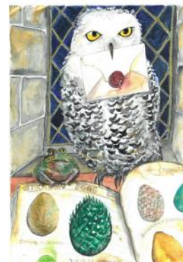
Class 6 – Adventures Harry Potter, London and futures

http://www.marlbrough.cornwall.sch.uk/website