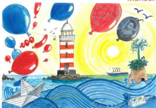
Class 1 – Oh, I do like to be beside the seaside! Flum Flum trees, lighthouses and holidays