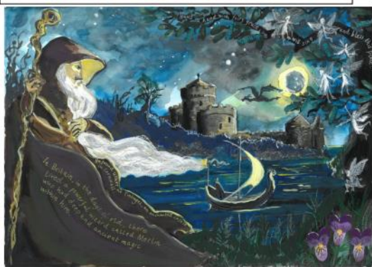
Class 4 – Castles and Rivers A journey through Cornwall